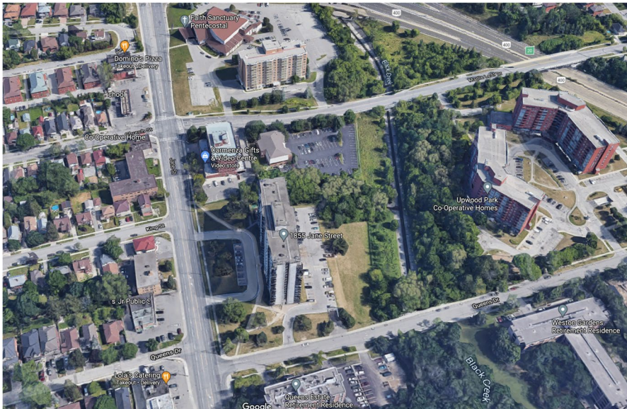
Fig. 2 A view of the neighbourhood of Rustic, in Toronto

As I returned to my car in the building's stark, exposed outdoor parking lot, it struck me with particular intensity (perhaps because of the wariness shown by the second recipient) how wide are the gulfs that separate me from most of the people to whom I delivered these bags and boxes. I have no experience with needing emergency food relief. To be sure, I was actually quite poor when I was a graduate student, living below poverty level for several years (which is fairly common among graduate students in North America, more so now than it was even then). Even so, I always had secure access to food and housing. Also, I knew I could draw on help from friends and family if I needed it. I have never known hunger as a direct existential threat. Nor have I experienced what I assume for most of the recipients was at least some degree of humiliation that attends reaching out for food relief, then having it dropped off by someone who is not only unfamiliar, but different in some