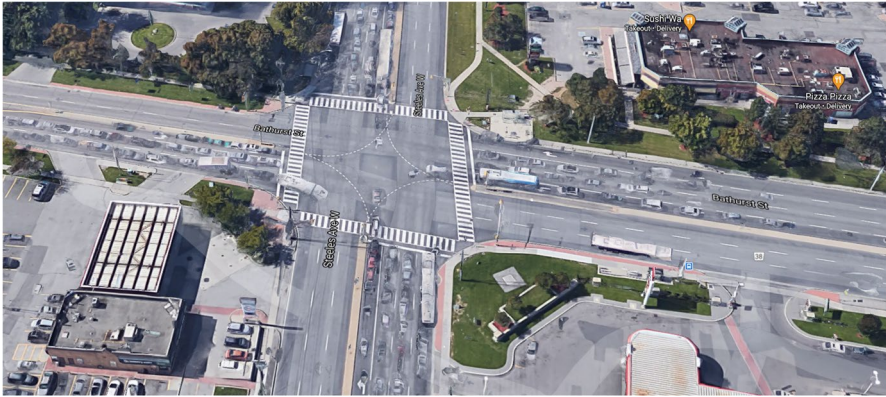
Fig. 1 The intersection of Bathurst Street and Steeles Avenue in Toronto

This encounter took place next to the intersection of Bathurst and Steeles Streets (see Fig. 1). In this part of the city, both roads are significant arteries, six lanes wide and typically rattling and rumbling with traffic all day long, though less so on the day in question. These are streetscapes whose design is something of a challenge to pedestrians, even more so to cyclists. They are emblematic of urban forms shaped by “automobility”, designed to serve motorised vehicles and thus part of what John Urry referred to as the broader “car system”. 3